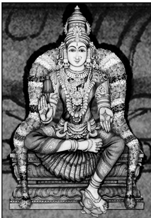
Šri Ādi Lakshmi

Saturday, July 4 th thru Saturday, August 22 nd , 2020