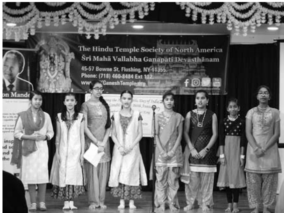
Republic Day of India Celebrations Saturday, February 1 st , 2020