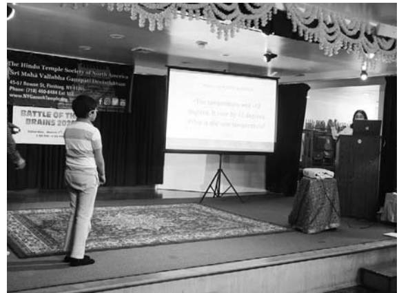
Battle of the Brains Saturday, March 7 th , 2020