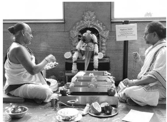
Rogahara Śān̥thi - Japam & Homam