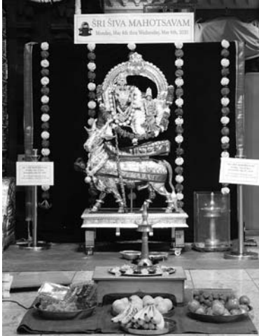
Śri Śiva Mahotsavam Monday, May 4 th - Wednesday, May 6 th , 2020