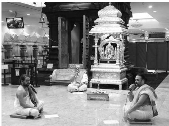
Online Chanting and Prayer