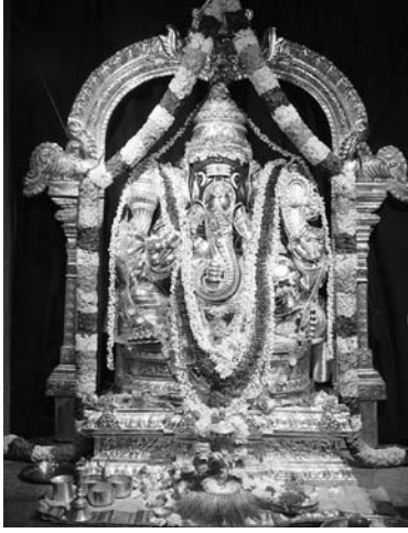
New Year's Day Wednesday, January 1 st , 2020