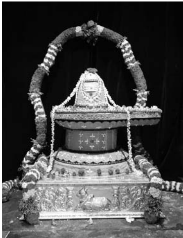
Mahā Śivarātri Celebrations Tuesday, February 18 th - Saturday, February 22 nd , 2020