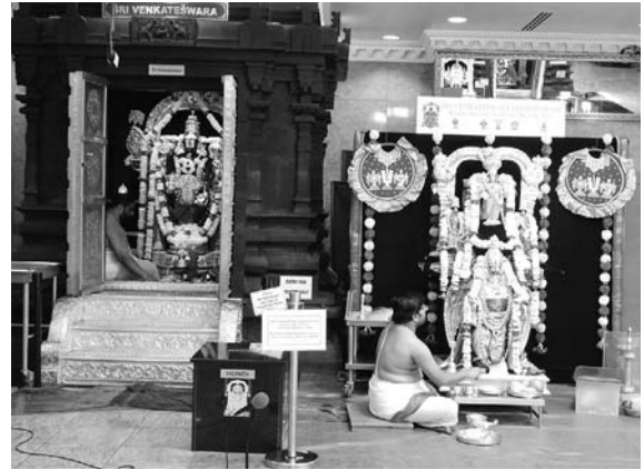
Śri Venkateśwara Mahotsavam Monday, May 11 th - Wednesday, May 13 th , 2020