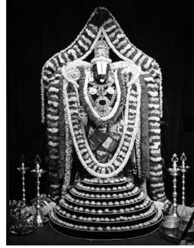
Vaikuntha Ekadasi Celebrations Monday January 6 th - Tuesday, January 7 th , 2020