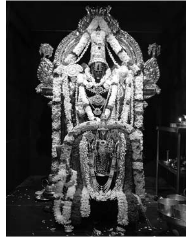
Śrī Dhanvantari Mantra Japam Tuesday, January 21 st - Saturday, January 25 th , 2020