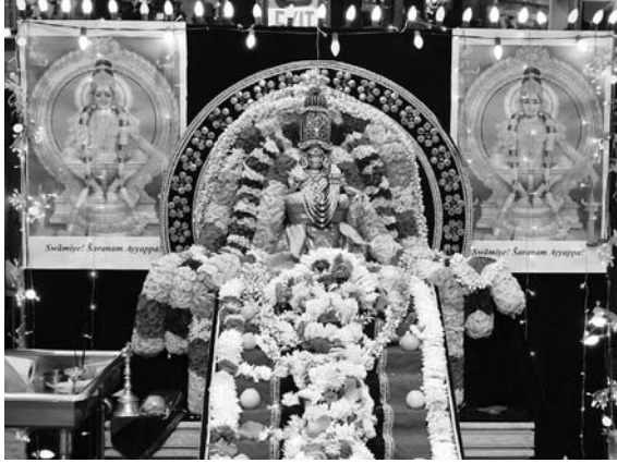
Makara Sankrānti - Śrī Ayyappa Pooja Tuesday, January 14 th , 2020