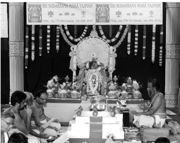
Śrī Sudarśana Yajnam

Monday, July 2 nd thru Wednesday, July 4 th , 2018