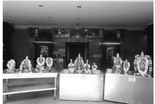
41 st Anniversary of the Temple

Friday, June 1 st - Sunday, June 10 th , 2018