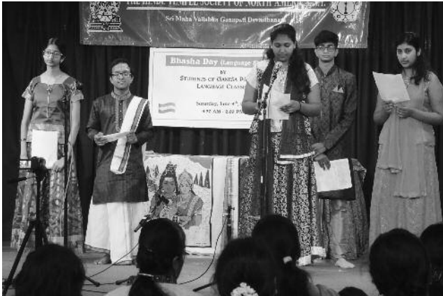
Bhāsha Day - Language showcase Saturday, June 9 th , 2018