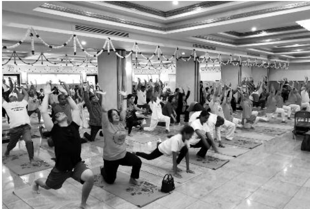
International Yoga Day Sunday, June 24 th , 2018