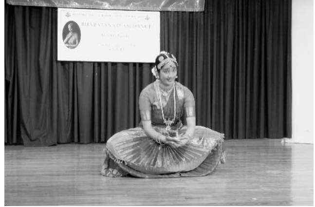
Bharatnatyam Dance - Śrī Venkateśwara Brahmotsavam Celebrations Saturday, June 2 nd , 2018