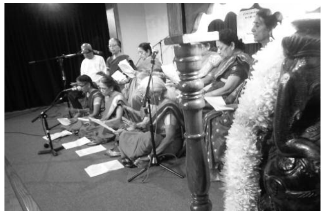
Anniversary Celebrations of Senior Program Saturday, October 6 th , 2018