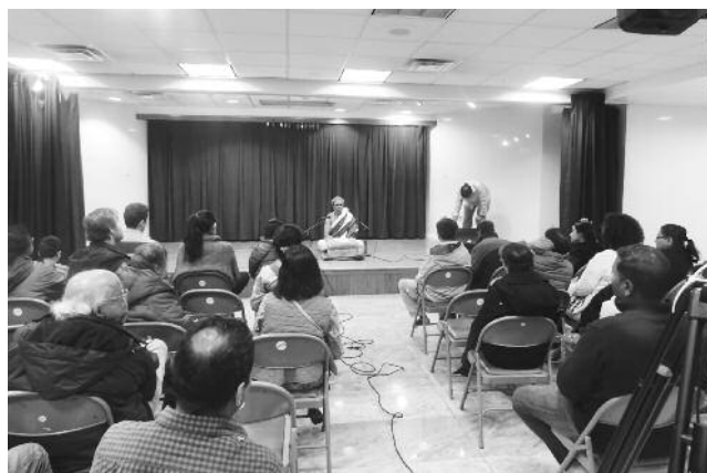
Learning Series 2018