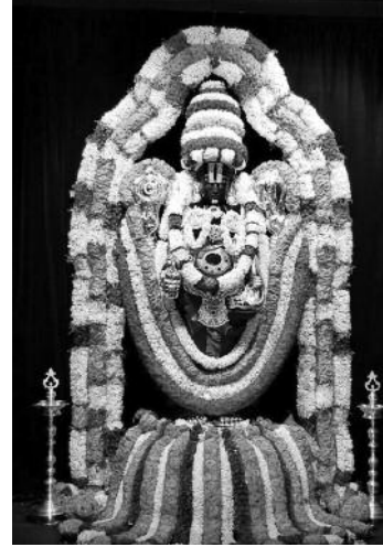
Śrī Venkateśwara Brahmotsavam

Thursday, May 24 th - Monday, May 28 th , 2018