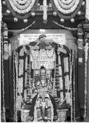
Šri Rāghavendra Swāmy Ārādhana Tuesday, August 28 th , 2018