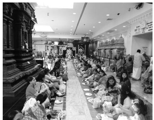
Śrī Vara Mahā Lakshmi Vratam

Friday, July 27 th thru Sunday, July 29 th , 2018