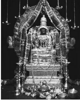
Deepāvali Celebrations Sunday, Nov. 4 th thru Tuesday, Nov. 6 th , 2018