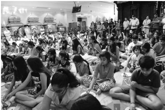
Šri Ganeša Chaturthi Nava - Dina Brahmotsavam Friday, September 7 th thru Sunday, September 16 th , 2018