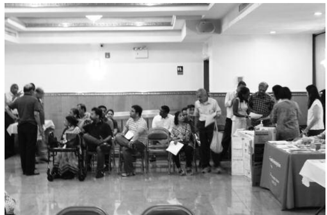
Health Fair Sunday, July 8 th , 2018