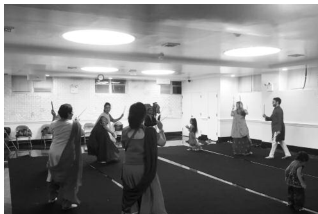
Ras Garba 2018