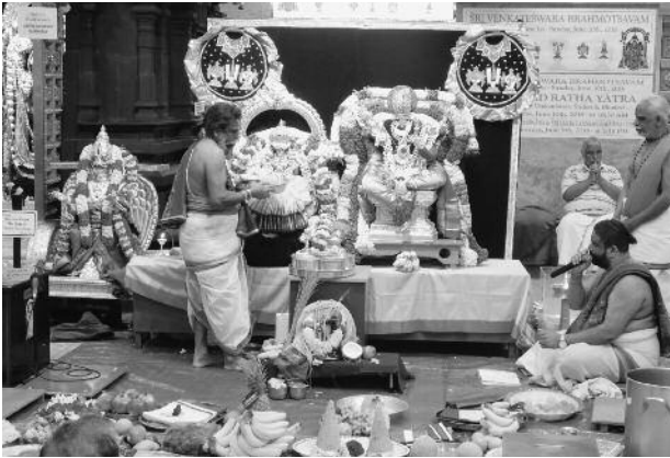
Śrī Venkateśwara Brahmotsavam

Friday, June 1 st - Sunday, June 10 th , 2018