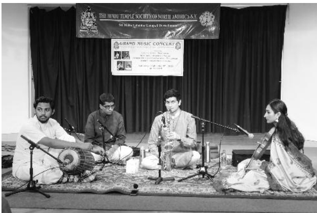
Music Concert - Śrī Ganeśa Chaturthi Celebrations Saturday, September 8 th , 2018