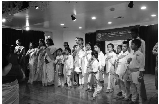
Indian Independence Day Sunday, August 19 th , 2018