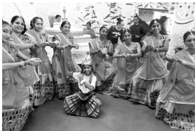
Deepāvali Celebrations - Queens Museum Sunday, November 11 th , 2018