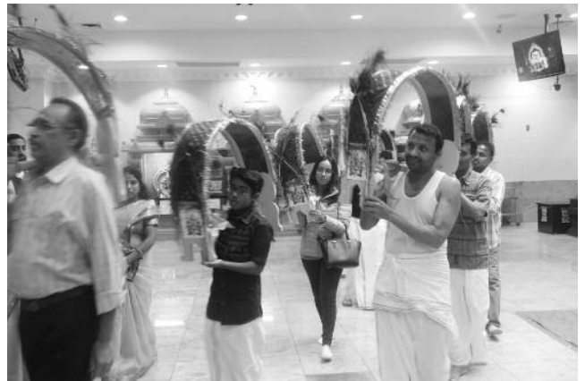
Skanda Shashti Mahotsavam Thursday, November 8 th thru Wednesday, November 14 th , 2018