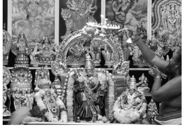
Śrī Devi Nava Rātri Mahotsavam Tuesday, October 9 th thru Thursday, October 18 th , 2018