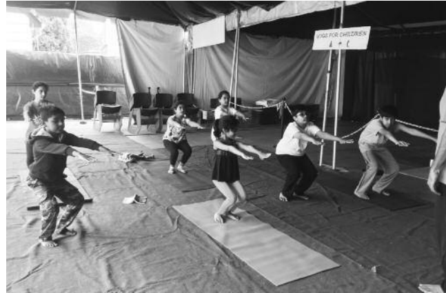
International Yoga Day Sunday, June 24 th , 2018