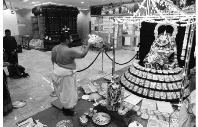
Śrī Govardhan Annakut Utsavam Thursday, Nov. 8 th thru Friday, Nov. 9 th , 2018