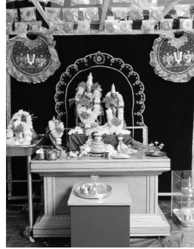
Šri Krishna Janmāshtami Sunday, September 2 nd , 2018