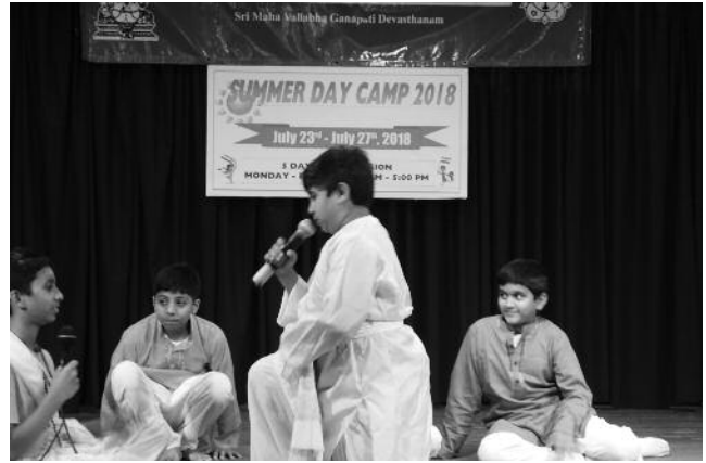
Summer Camp Monday, July 23 rd - Friday, July 27 th , 2018