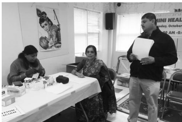
Mini Health Fair Sunday, October 14 th , 2018