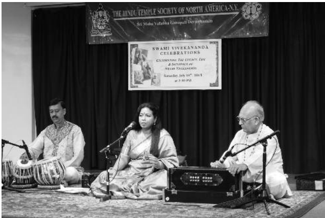
Swamy Vivekananda Day Celebrations Saturday, July 14 th , 2018