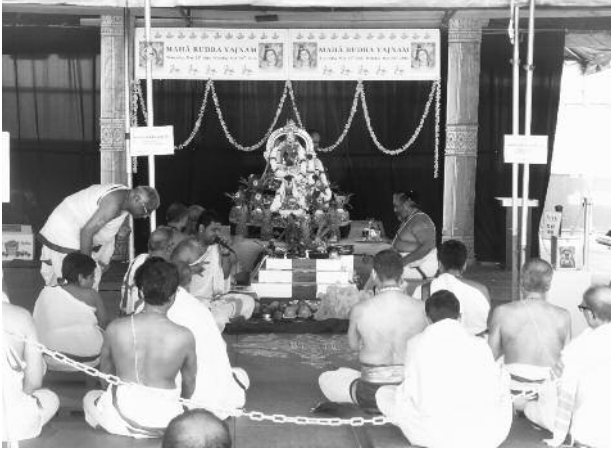
Śrī Mahā Rudra Yajnam

Thursday, May 24 th - Monday, May 28 th , 2018