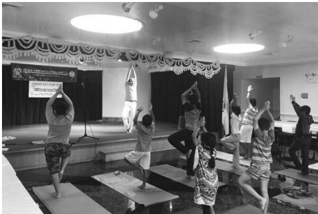
Summer Camp Monday, July 23 rd - Friday, July 27 th , 2018