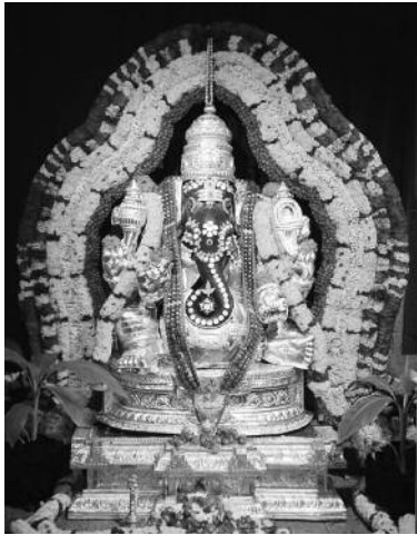
Šri Ganeša Chaturthi Nava - Dina Brahmotsavam Friday, September 7 th thru Sunday, September 16 th , 2018