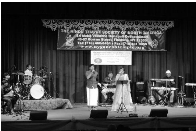
Grand Musical Ensemble - 41 st Anniversary of the Temple Celebrations Saturday, July 7 th , 2018