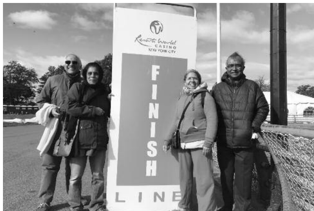
Breast Cancer Walk - Flushing Meadow Park Sunday, October 21 st , 2018