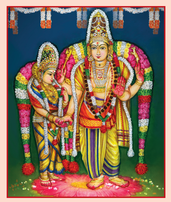
Šri Arul Vallanatha Swami (Šiva) with Annai Šri Kokilambal (Šakti)

Saturday, February 10th thru Wednesday, February 14th 2018