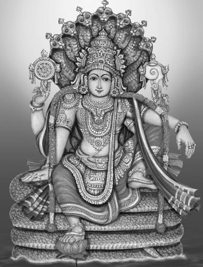
Śri Aadhi Moorthi

Mon. November 27 th , 2017 - Tue. January 30 th , 2018