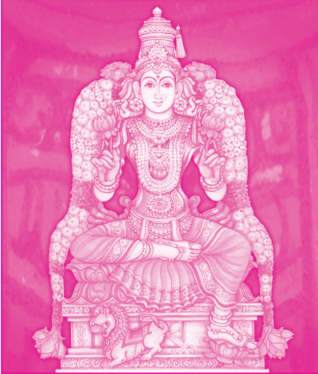
Šri Skanda Mātā Durga Devi

Saturday, October 1 st thru Tuesday, November 15 th , 2016