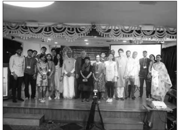
Anubhava 2026: Annual Akshayam Conference Saturday, May 2 nd , 2026