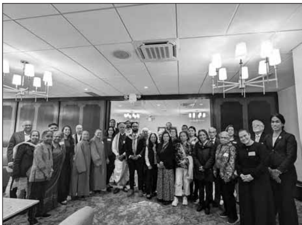
'Sacred Farewells' - Jewish & AAPI Mourning Traditions Tuesday, May 12 th , 2026