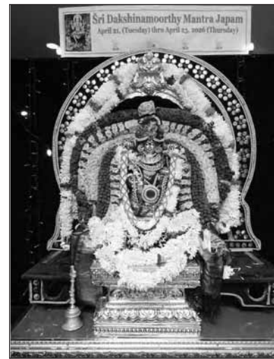
Śri Dakshinamoorthy Mantra Japam Tuesday, April 21 st - Thursday, April 23 rd , 2026