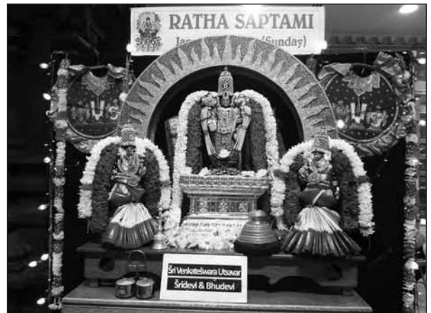
Ratha Saptami Sunday, January 25 th , 2026