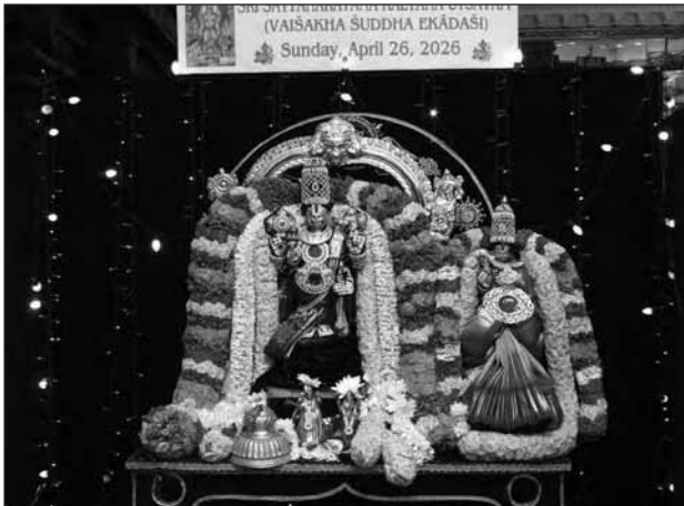
Śri Satyanārāyana Kalyāna Utsavam Sunday, April 26 th , 2026