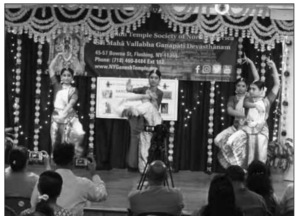
Dance Program - Sri Siva Mahotsavam celebrations Saturday, May 30 th , 2026