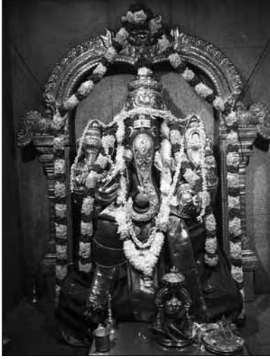
New Year's Day Thursday, January 1 st , 2026