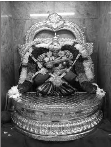
Vasanta Panchami Friday, January 23 rd , 2026