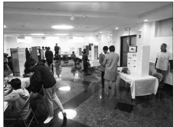
STEM Fair 2026 Sunday, March 8 th , 2026