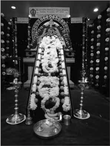
Makara Sankrānti - Śrī Ayyappa Pooja Wednesday, January 14 th , 2026