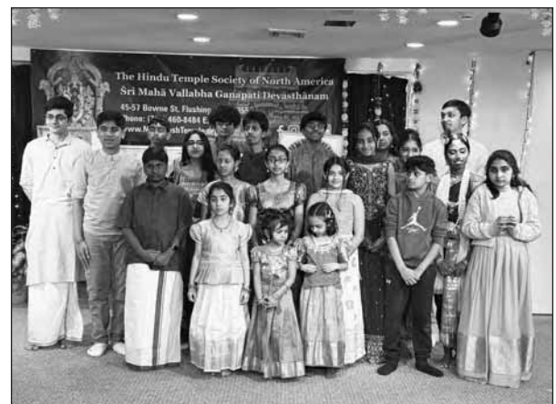
Festivals of India - HTS Youth Group Saturday, March 28 th , 2026