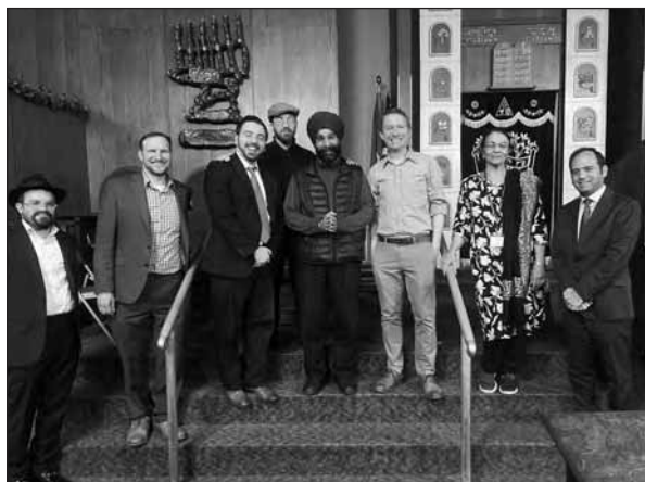
Queens Clergy Fellowship session Tuesday, March 10 th , 2026