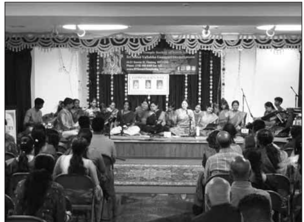
Annual Composer's Day Saturday, April 18 th , 2026