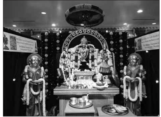
Śri Rāma Navami Utsavam Thursday, March 19 th - Thursday, March 26 th , 2026