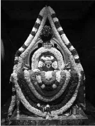
Mahā Śivarātri Celebrations Thursday, February 12 th - Sunday, February 15 th , 2026