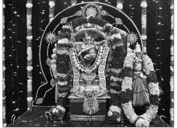
Ārdra Darśanam Friday, January 2 nd , 2026