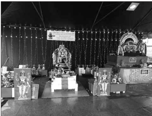
Śri Śiva Mahotsavam Friday, May 22 nd - Sunday, May 31 st , 2026