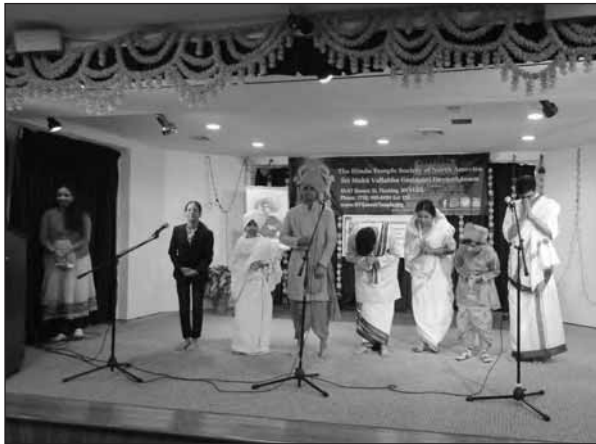
Swami Vivekananda Day Saturday, April 25 th , 2025