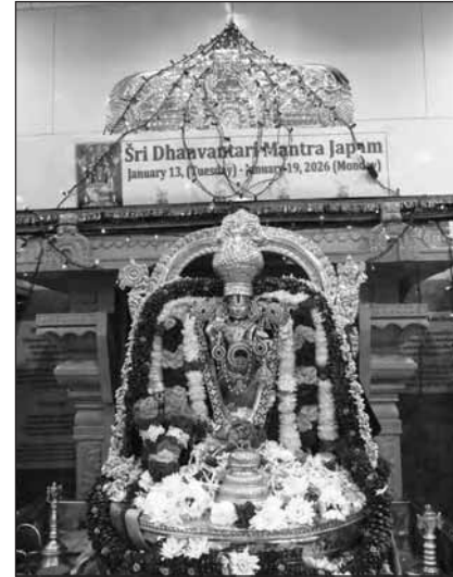
Śrī Dhanvantari Mantra Japam Tuesday, January 13 th - Monday, January 19 th , 2026