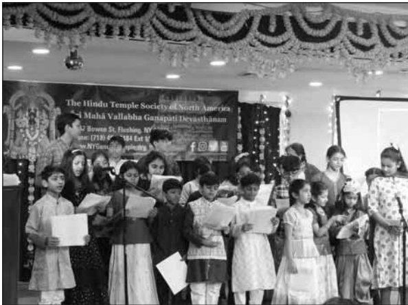
Annual Ganeša Pātašāla Celebrations Saturday, December 20 th , 2025