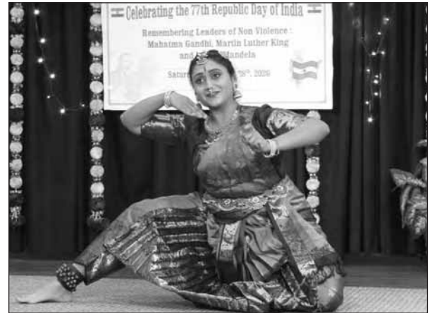
Republic Day Celebrations Saturday, February 28 th , 2026