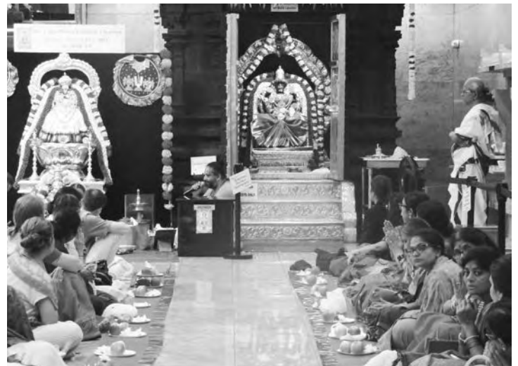
Vara Maha Lakshmi Vratam Friday, August 25 th , 2023