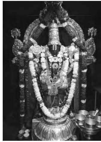
46 th Anniversary of the Temple Tuesday, July 4 th , 2023