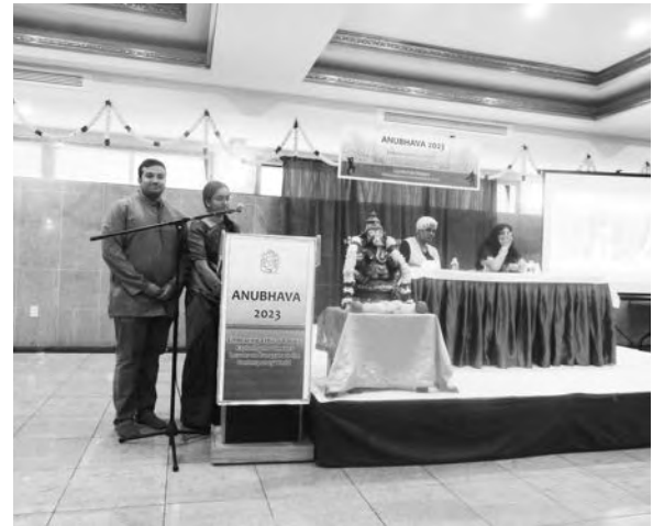
Anubhava 2023 (Akshayam) - Annual Conference Saturday, August 26 th , 2023