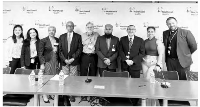
Seminar - Religious Perspectives on Organ Donation Wednesday, August 16 th , 2023