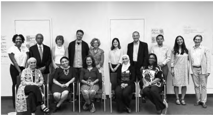
NYC Hate & Bias Prevention Regional Council meeting Thursday, June 8 th , 2023

New York State Governor Kathy Hochul visited our Temple to sign the “Diwali School Holiday” bill in the presence of several elected officials, community leaders, dignitaries, and a public audience. This historic bill signing was organized at the Auditorium of The Hindu Temple Community Center on November 14, 2023.