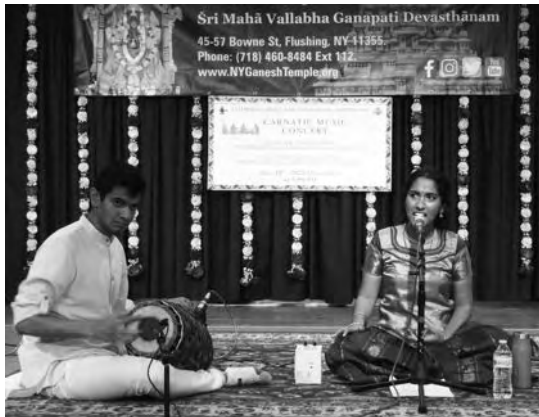
Carnatic Music Concert for Sri Siva & Sri Venkateswara Mahotsavam Saturday, June 10 th , 2023