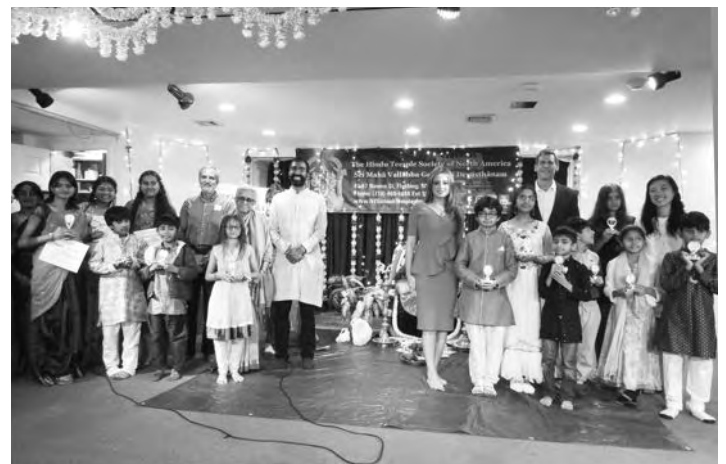
Deepavali Cultural Celebrations Sunday, November 19 th , 2023