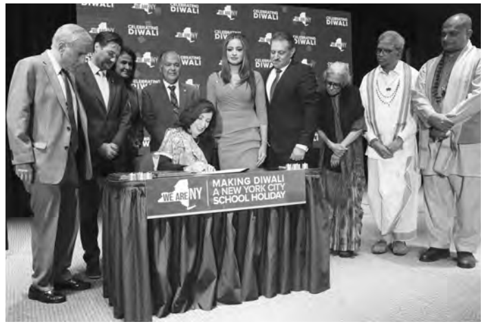
Diwali Reception with Governor Hochul - Official bill signing for Diwali school holiday in NYC public schools. Tuesday, November 14 th , 2023