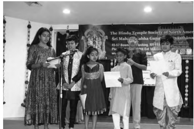
Bhasha Day (Patasala Language showcase) Saturday, June 24 th , 2023