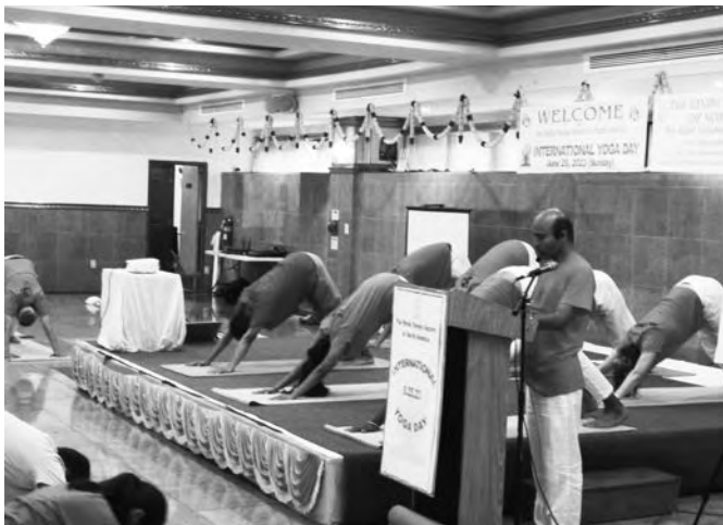
9 th International Yoga Day Sunday, June 25 th , 2023