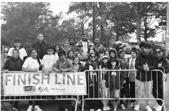
Cancer Walk Sunday, October 15 th , 2023