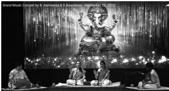
Grand Music Concert - Sri Ganesa Chaturthi Celebrations Friday, September 22 nd , 2023