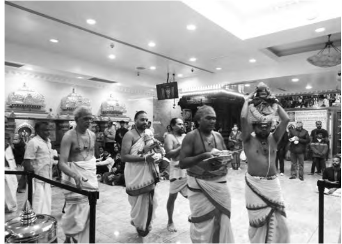
Skanda Shashti Mahotsavam Monday, November 13 th - Sunday, November 19 th , 2023