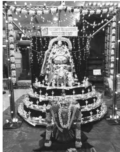
Deepāvāli Celebrations Friday, November 10 th - Sunday, November 12 th , 2023