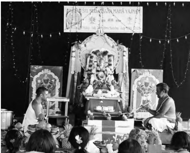
Śri Sudarśana Mahā Yajnam Friday, July 28 th - Sunday, July 30 th , 2023