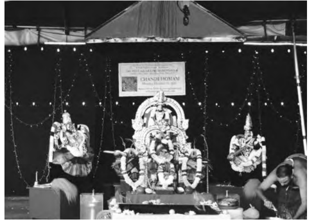
Šri Devi Navaratri Mahotsavam Sunday, October 15 th - Monday, October 23 rd , 2023