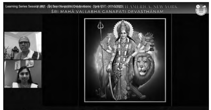
Learning Series - Session #61 "Śri Devi Navarātri Celebrations" Sunday, October 15 th , 2023