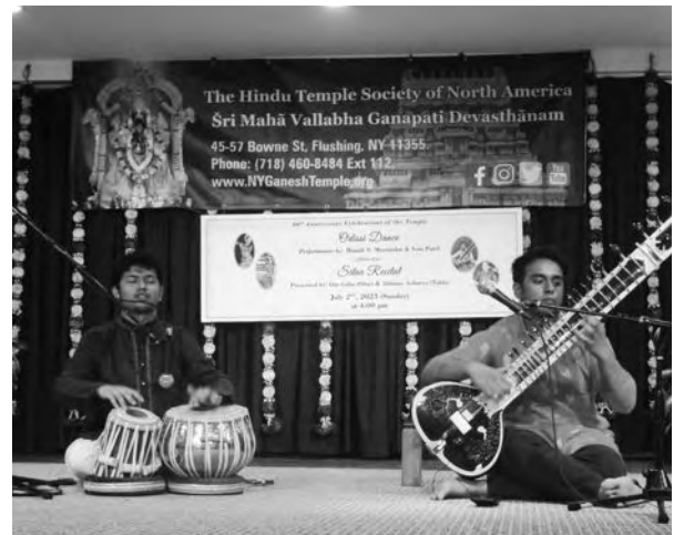
Odissi Dance & Sitar Recital - (46 th Temple Anniversary) Sunday, July 2 nd , 2023