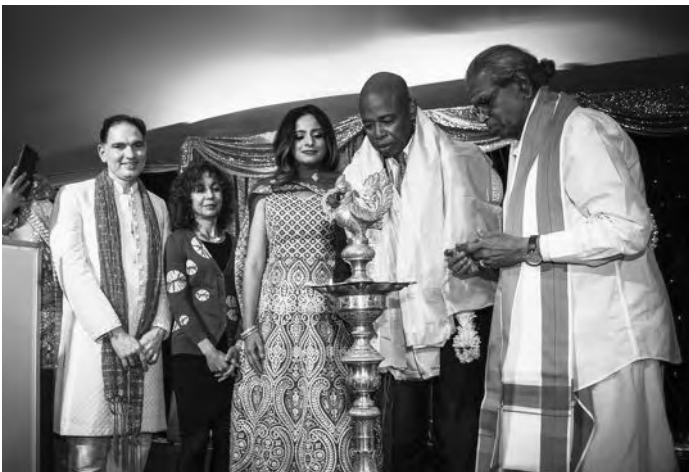
NYC Mayor's Deepavali event - Gracie Mansion Tuesday, October 17 th , 2023