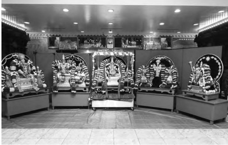
Šri Ganeša Chaturthi Nava Dina Brahmotsavam Friday, September 15 th - September 24 th , 2023