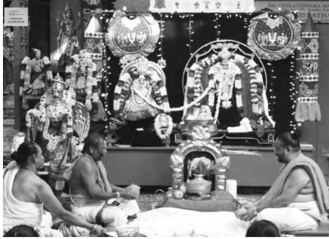
Śri Venkateśwara Mahotsavam Friday, June 9 th - Sunday, June 18 th , 2023