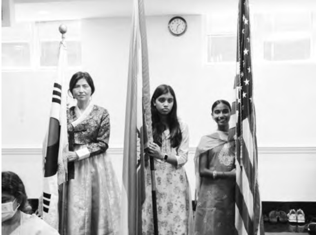
India & Korea Independence Day Celebrations Sunday, August 13 th , 2023