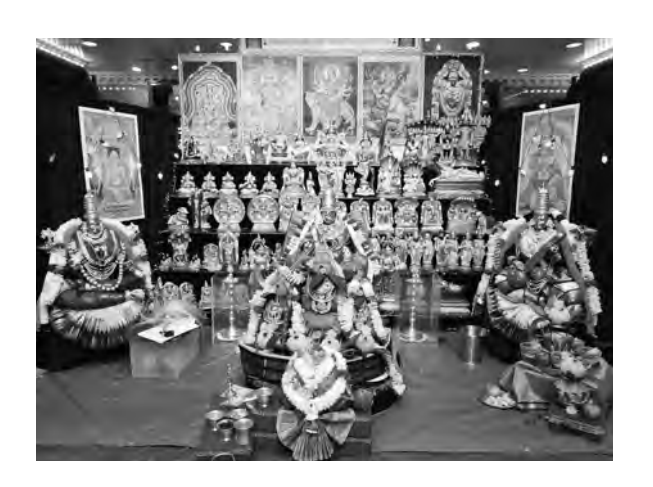
Sri Devi Navaratri Mahotsavam Saturday, October 17<sup>th</sup> - Sunday, October 25<sup>th</sup>, 2020