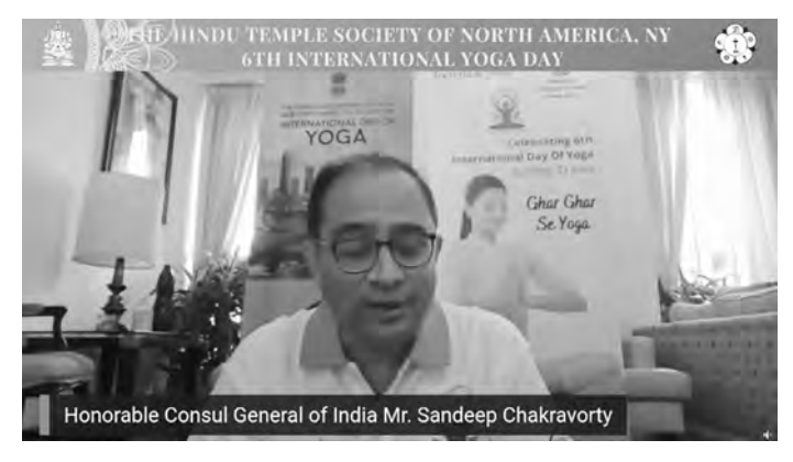
6th International Yoga Day Sunday, June 21<sup>st</sup>, 2020