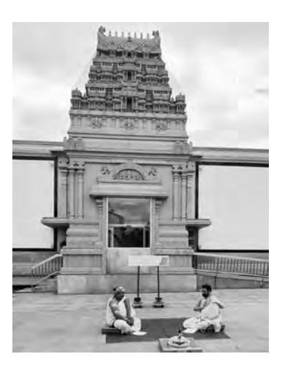
Covid Memorial Service Sunday, May 24<sup>th</sup>, 2020