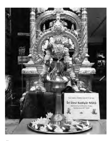
Šri Devi Khodiyãr Mãta Pooja Sunday, June 7<sup>th</sup>, 2020