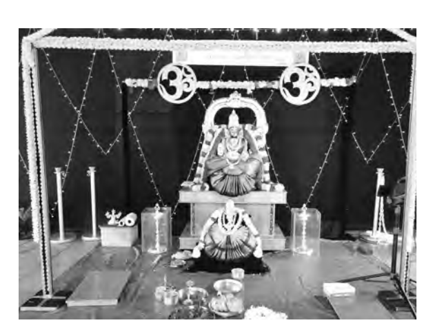
Vara Maha Lakshmi Vratam Friday, July 31<sup>st</sup>, 2020