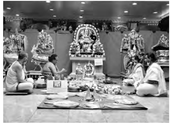
Sri Ganesa Chaturthi Nava Dina Brahmotsavam Friday, August 14<sup>th</sup> - Sunday, August 23<sup>rd</sup>, 2020