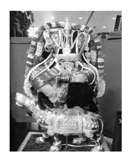
Sri Ganesa Chaturthi Nava Dina Brahmotsavam Friday, August 14<sup>th</sup> - Sunday, August 23<sup>rd</sup>, 2020