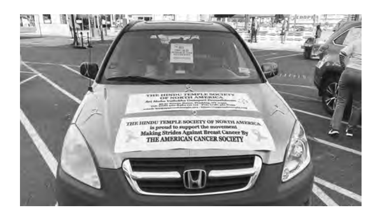
Breast Cancer Drive-thru Sunday, October 18<sup>th</sup>, 2020