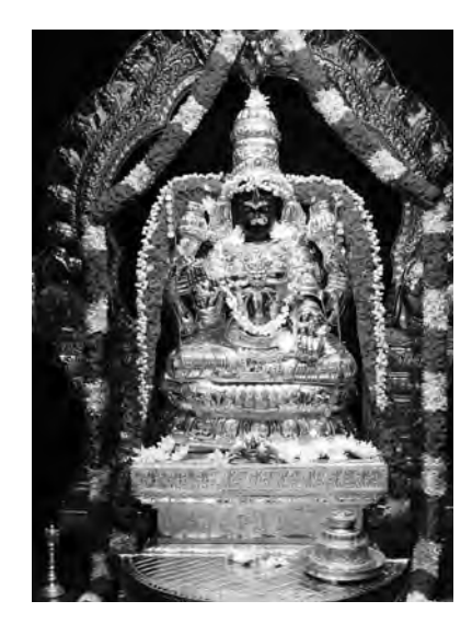
Deepavali Celebrations Thursday, November 12<sup>th</sup> - Saturday, November 14<sup>th</sup>, 2020