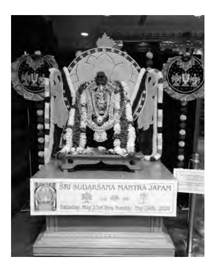
Šri Sudaršana Mantra Japam Saturday, May 23<sup>rd</sup> - Sunday, May 24<sup>th</sup>, 2020