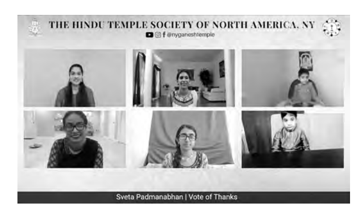
"Vimochana" (relief) Sunday, June 7<sup>th</sup>, 2020