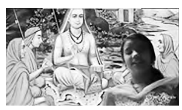
Archarya Day Saturday, May 2<sup>nd</sup>, 2020