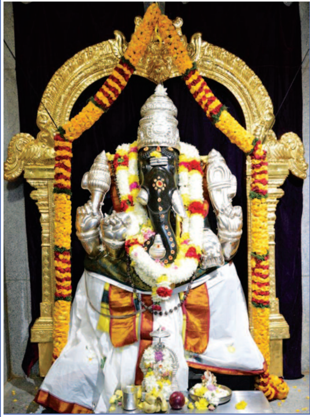
ŚRI MAHĀ VALLABHA GANAPATI

THE HINDU TEMPLE SOCIETY OF NORTH AMERICA, NY Śri Mahā Vallabha Ganapati Devasthānam 45-57 Bowne Street, Flushing, NY 11355-2202 Tel: (718) 460-8484 ext.112 • Fax: (718) 461-8055 email: hts@nyganeshtemple.org • http://nyganeshtemple.org